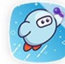
Sora - OCPS

Library Research Tools, in LaunchPad, have many different opportunities to find eBooks & audiobooks to read!